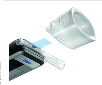
Fast switchover from funnel-based to mouthpiece-based testing