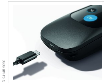
USB-C Interface for easy charging of the lithium version (while stationary or on the move)