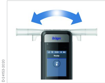
Mouthpiece receptacle can be mounted on left or right