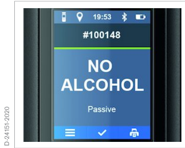
The 2.4" colour display provides information, notices and warnings