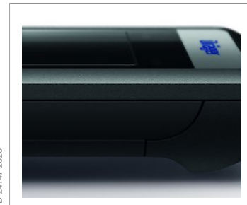
Rubberised handling area for a secure grip