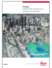
Leica HxMap High-performance multisensor workflow

Leica Geosystems AG leica-geosystems.com