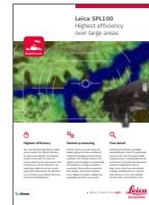
Leica SPL100 Highest efficiency over large areas