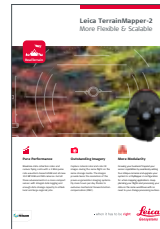
Leica TerrainMapper-2 Flexibility & Scalability