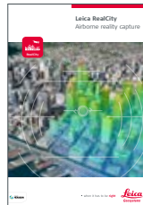
Leica RealCity Airborne reality capture

Illustrations, descriptions and technical data are not binding. All rights reserved. Printed in Switzerland – Copyright Leica Geosystems AG, Heerbrugg, Switzerland, 2020. 853386en – 10.20